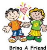
Bring A Friend

Wednesdays, 6:50 p.m. - 8:00 p.m. Ages 3 - 6th Grade (Must be age 3 years by September 1, 2009)